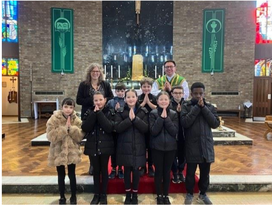
Year 6 Confirmandi