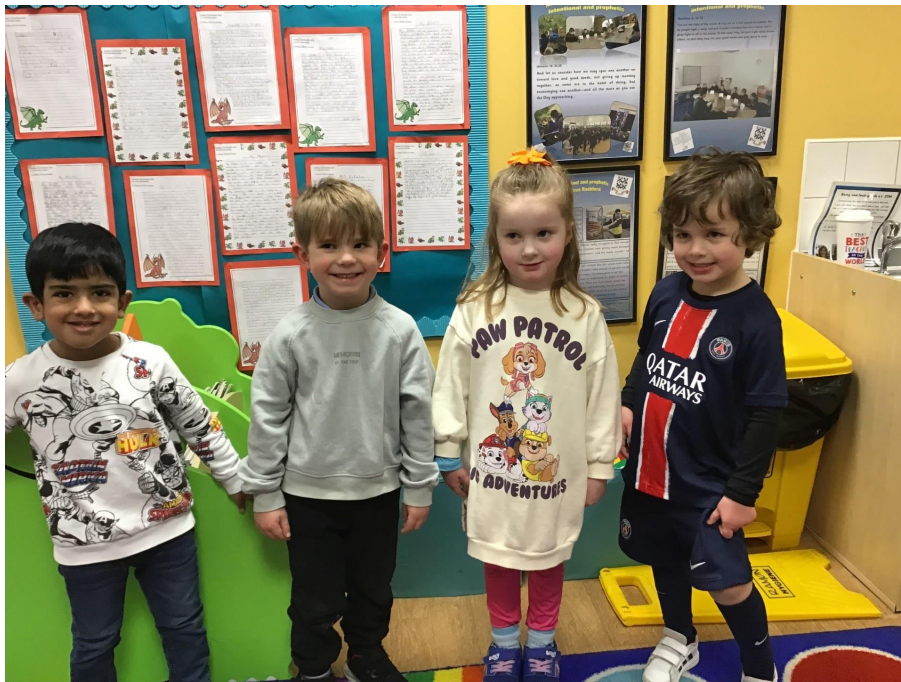
Times Tables Rock Stars MAC Competition