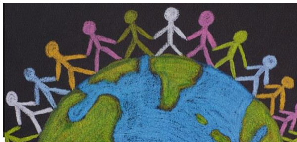
1 - Inspiration for Reception's art

For we are his workmanship, created in Christ Jesus for good works, which God prepared beforehand, that we should walk in them.