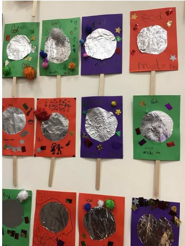
3 - Year 1