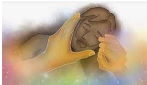
5 - Inspiration for Year 3's art

I praise you, for I am fearfully and wonderfully made.