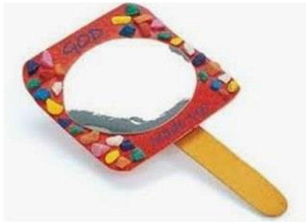
2 - Inspiration for Year 1's art

But we all, with unveiled face, beholding as in a mirror the glory of the Lord, are being transformed into the same image from glory to glory, just as from the Lord, the Spirit.