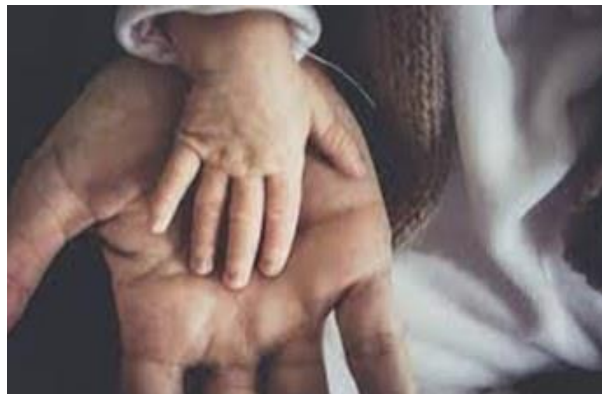
4 - Inspiration for Year 2's art

I am continually with you; you hold my right hand