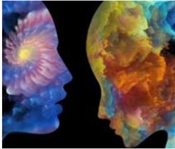
7 - Inspiration for Year 5's art

It is the Spirit who gives life; the flesh is no help at all. The words that I have spoken to you are spirit and life