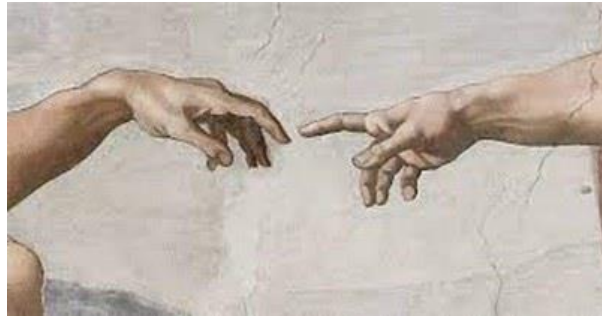
6 - Inspiration for Year 4's art

Then the Lord God formed the man of dust from the ground and breathed into his nostrils the breath of life, and the man became a living creature.