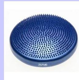
sit fit cushion